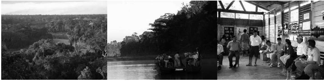
Figure 3. The Western Amazon of Peru is a biodiversity hotspot, with over 5 \times 10^6 ha of government protected areas (left). Ecotourists looking for hoatzins and giant otters in Tres Chimbadas oxbow lake, Tambopata, Peru (center) bring revenue, employment, and new opportunities to local communities, thus adding value to rainforest biodiversity. Indigenous leaders from Ecuador, Peru, and Bolivia met over a series of workshops in 2003 to exchange lessons learned in ecotourism management (right).

gions on earth (Foster et al. , 1994; Mittermeier et al. , 2004) and is marked by great human diversity, including uncontacted indigenous peoples, legally-titled indigenous communities, second-generation riberños and mestizos , Aymara and Quechua-speaking colonists from the highlands, and international ecotourists (Chicchon, 2001; Stronza, 2008; Figure 3). It is one of the most pristine regions in the Americas, largely due to lack of transportation and access. There are over 5 \times 10^6 ha of government protected areas, a size greater than the total land area of Costa Rica. It includes the Bahuaja-Sonene National Park and Manu National Park in southeastern Peru. However, threats from logging; gold mining; over-harvesting of game, fish and forest products; expansion of ranching; coca cultivation; and wildlife trafficking are continually increasing (Álvarez and Naughton-Treves, 2003; Killeen, 2007).